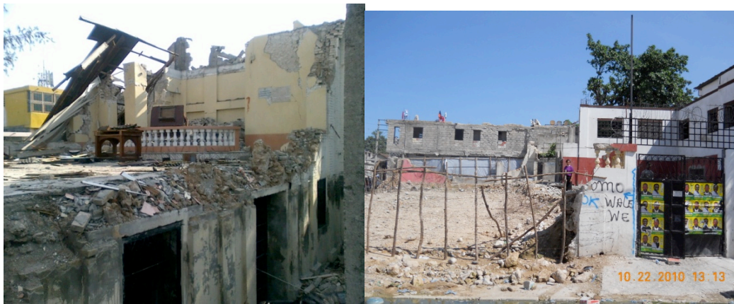
St. Paul AMEC - Jan. 12, 2010 June 26, 2011 (18 months later)

June 26-29, 2011 – One Year Later 18 months Later